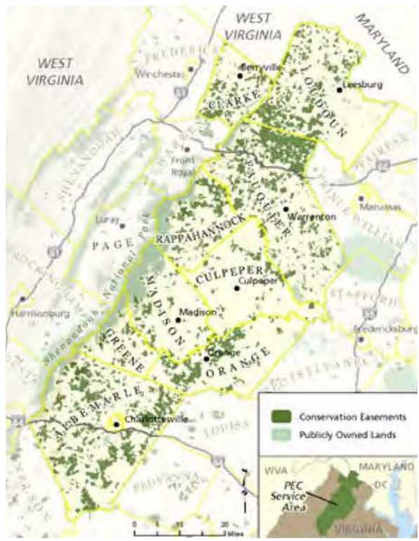
The Piedmont Environmental Council’s nine-county region. See full-size map on page seven.

The good news is that you can do something to ensure that the beauty and abundance of the Piedmont endures for the benefit of all, that this place is forever characterized by its open spaces, beautiful vistas, healthy environment, and cultural heritage. You can permanently protect your land from development through the gift of a conservation easement.