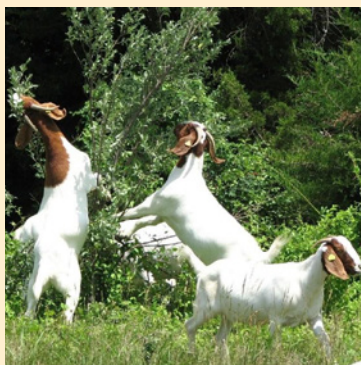
Goats removing invasive plants.

www.bees-on-the-net.com/virginia-beekeepers.html