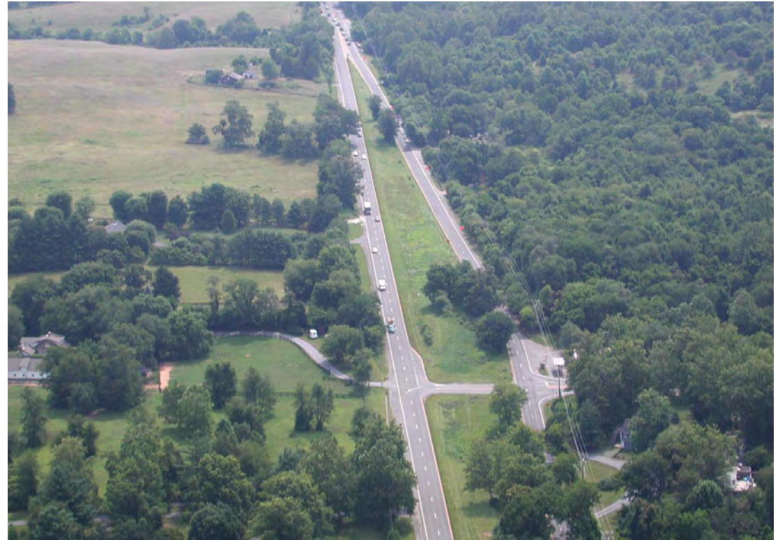
4 lane section, looking east towards Middleburg